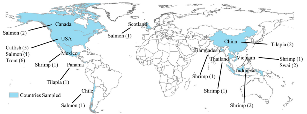
Figure 1. Map showing countries from which seafood samples originated (n= number of samples).